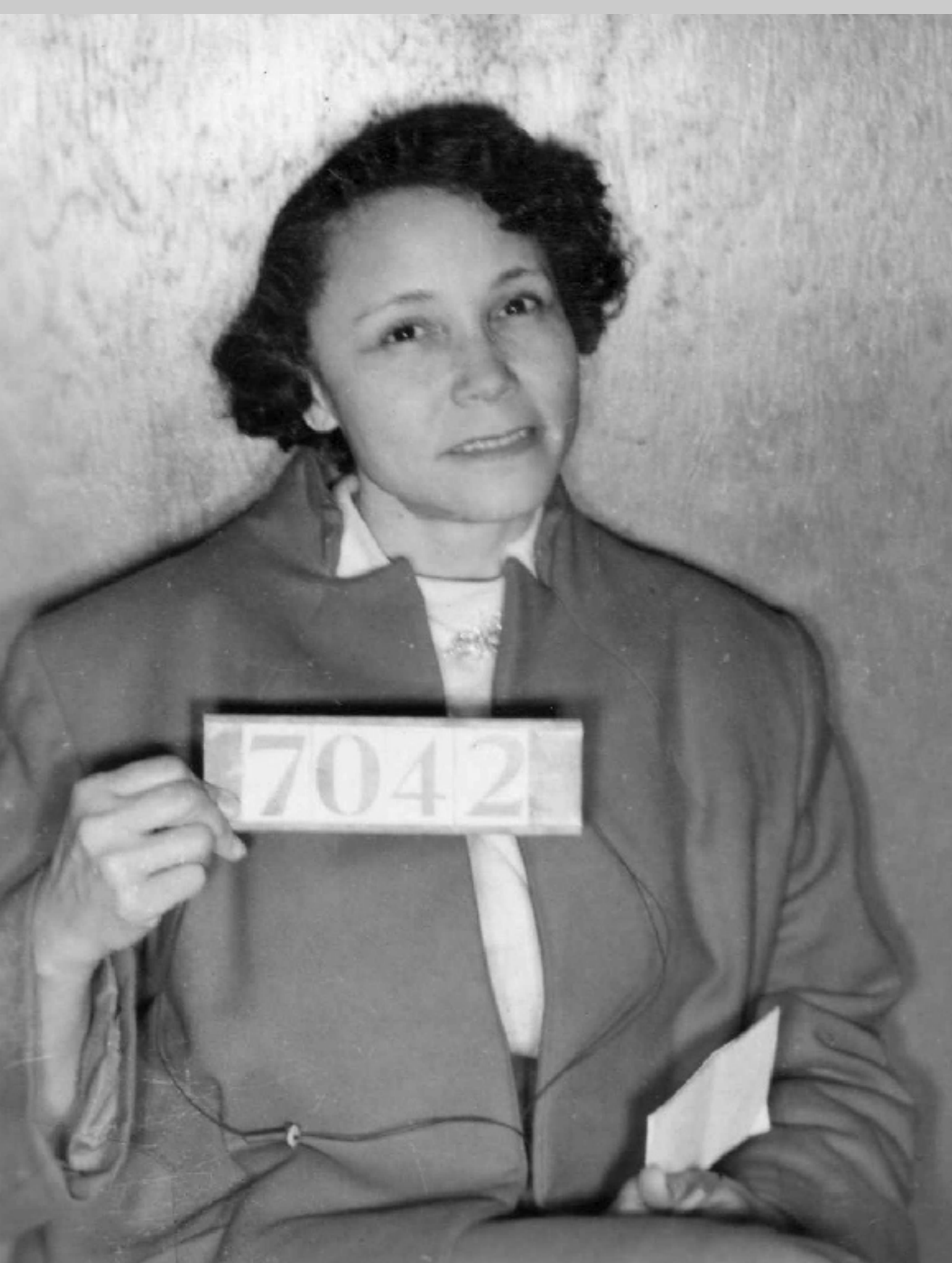
Jo Ann Robinson